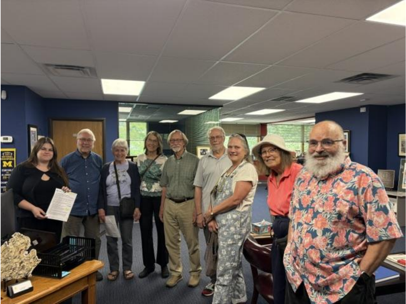
FCNL Washtenaw Advocacy Team

Members of the FCNL Washtenaw Advocacy Team delivered a request to Representative Debbie Dingell on May 29 to sign on as a co-sponsor of H. R. 8592, a new bill demanding No Funding for war with Iran. The team meets monthly on the fourth Wednesday at 9:30am, alternating between AAFM Corner Room and Chelsea Library. Interested in joining us? Next meeting is on July 22 at the Chelsea Library.