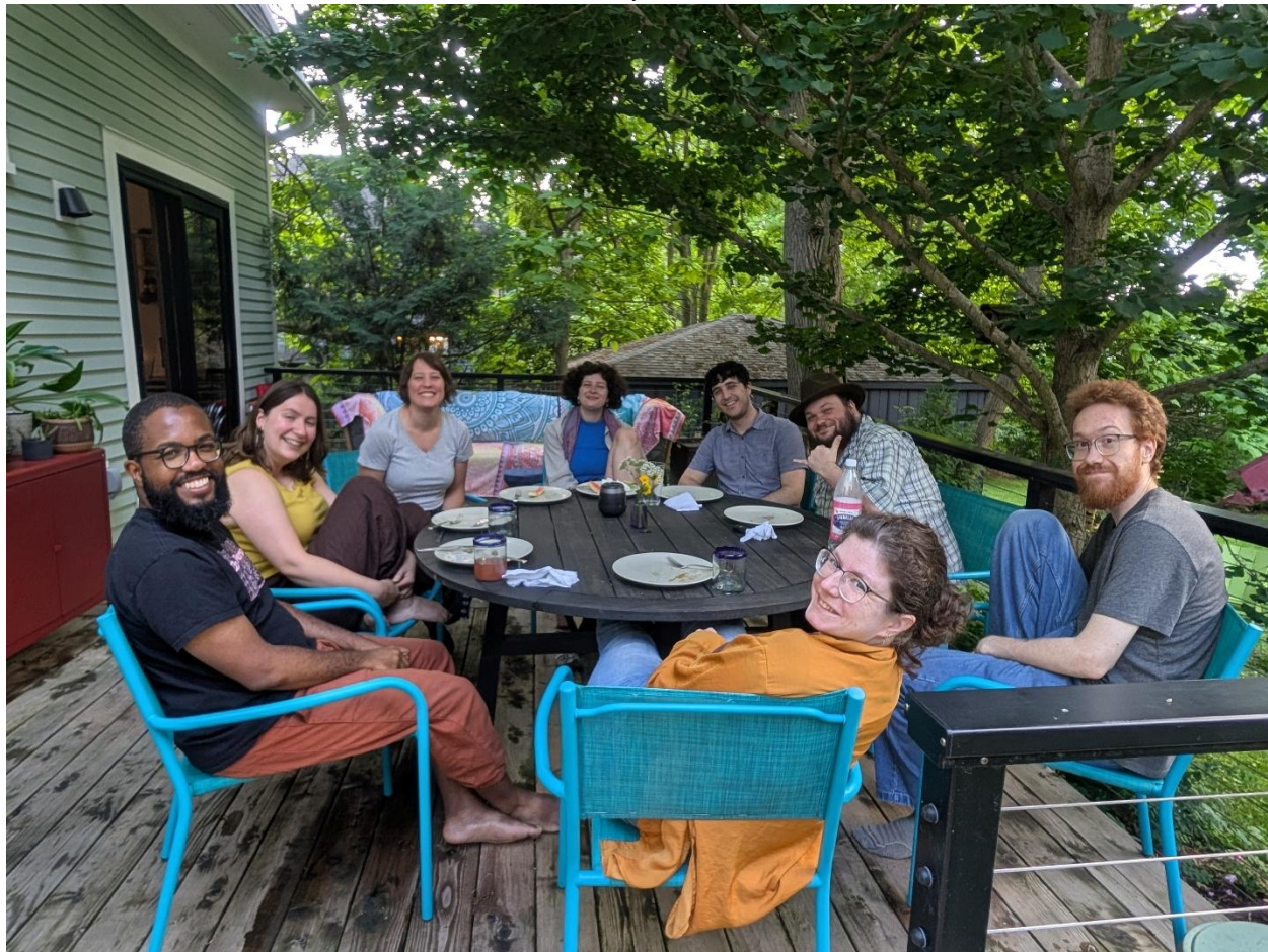
The June YAF Dinner

Meeting Announcements: 4 Among Friends: 7 Special Messages: 8 Larger Circles of Friends: 10 Community Events: 11