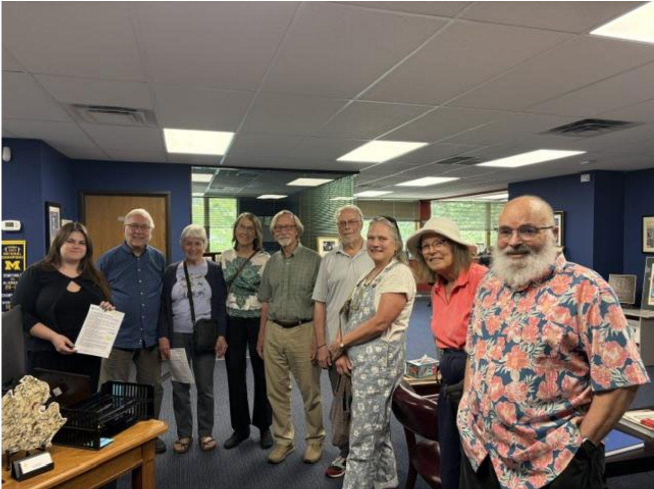
FCNL Washtenaw Advocacy Team

Members of the FCNL Washtenaw Advocacy Team delivered a request to Representative Debbie Dingell on May 29 to sign on as a co-sponsor of H. R. 8592, a new bill demanding No Funding for war with Iran. The team meets monthly on the fourth Wednesday at 9:30am, alternating between AAFM Corner Room and Chelsea Library. Interested in joining us? Next meeting is on June 24 at AAFM.