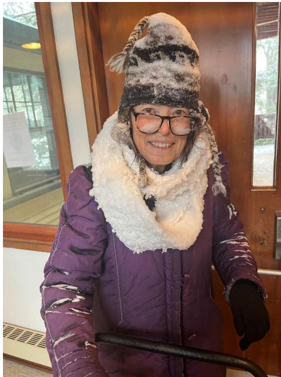
Our intrepid Quaker braves the elements

Group volunteering is more than welcomed and encouraged! If you could forward this to your networks and/or others who would be interested, it would be greatly appreciated! We are looking forward to seeing you on Powwow weekend!