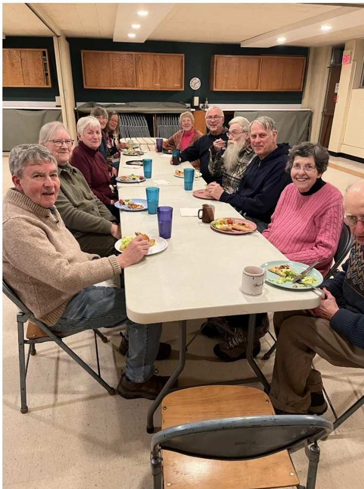
Dinner post-LEYM query worship share and discussion