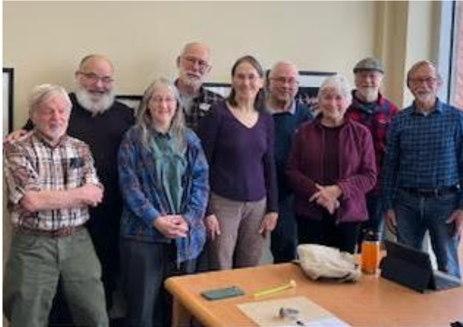
FCNL Washtenaw Advocacy Team